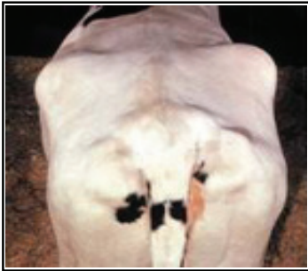
VPP Beef Niche Market Cow earns a premium - BCS #3

DQC Dairy Quality Center a Division of Agri-Education, Inc.