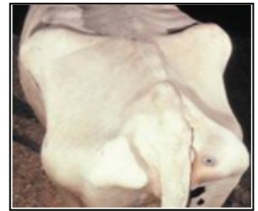
Unworthy of selling into the VPP Beef Niche Market - BCS #1